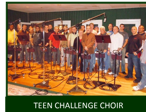
TEEN CHALLENGE CHOIR

Please include this in your daily prayers.